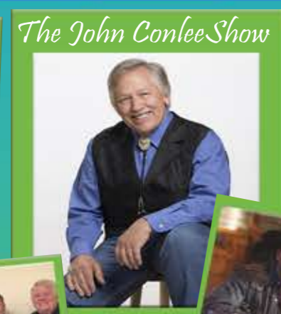
The John Conlee Show