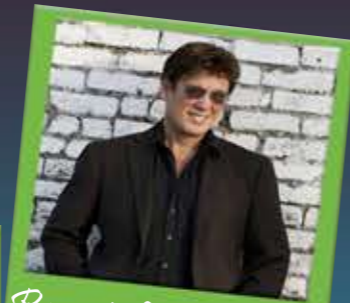
Ronnie McDowell & Highridge