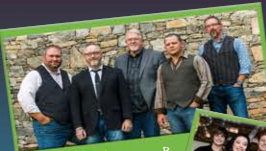
Balsam Range & Raven & Red