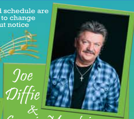
Joe Diffie & Georgia Mountain Fair Band